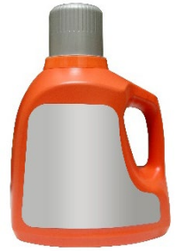
Figure 4