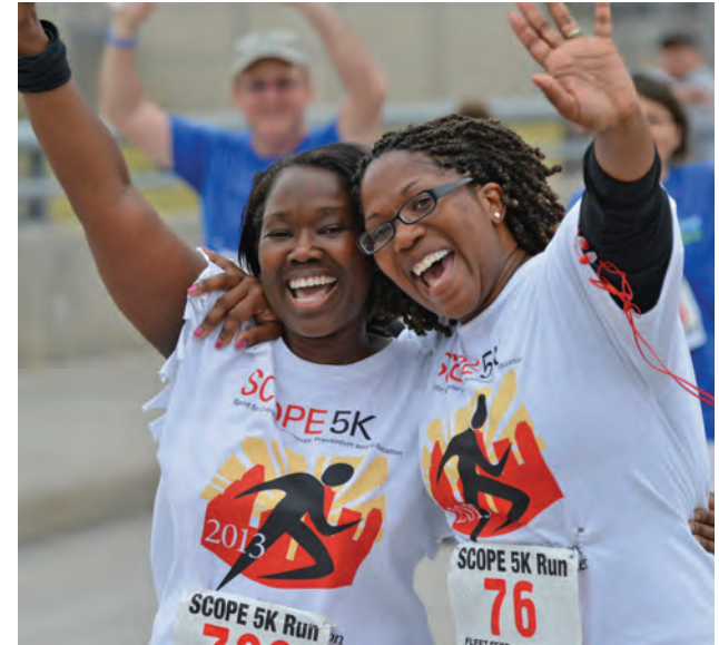
More than 2,000 people registered for the 2013 SCOPE 5K (Sprint for Colorectal Oncology Prevention and Education), which raised approximately $80,000 to support colorectal oncology prevention and education.